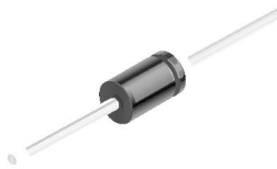
DO-41 Glass case COLOR BAND DENOTES CATHODE