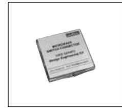
E. 4-3/4x4-3/4x3/4 Hard Plastic Box