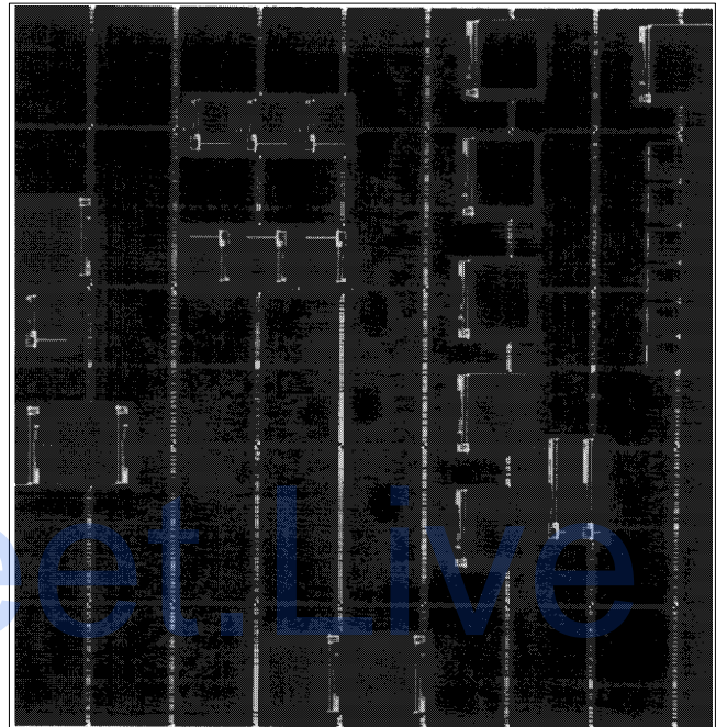
Fujitsu Microelectronics, Inc.'s CE51654 647,000 Available Gate .5 Micron Embedded Array, Containing 28 Embedded Macro Cells