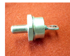
1N4510 Standard Rectifier (trr More Than 500ns)