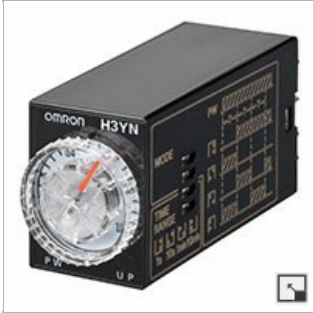
Timer DPDT 0.1s-10min Black DC12

Printable Page Download PDF Email This Page