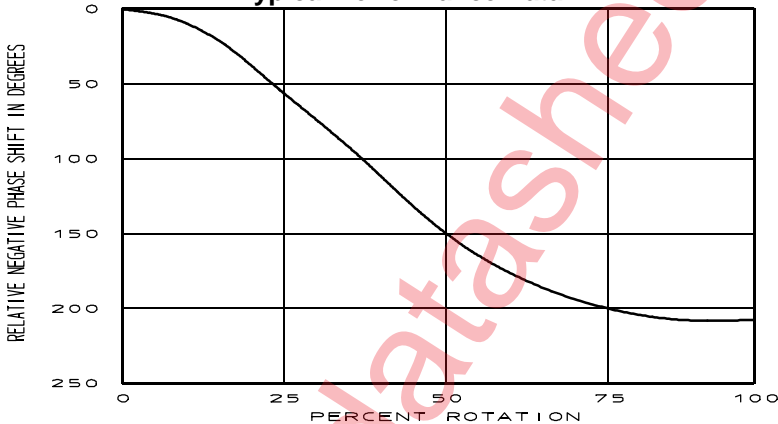
Typical Performance Data

Drive Rotation for maximum phase shift: Half-Turn nom. Connectors: BNC Female Weight: 10 oz. (285 g) Operating Temp: -55° to +85°C